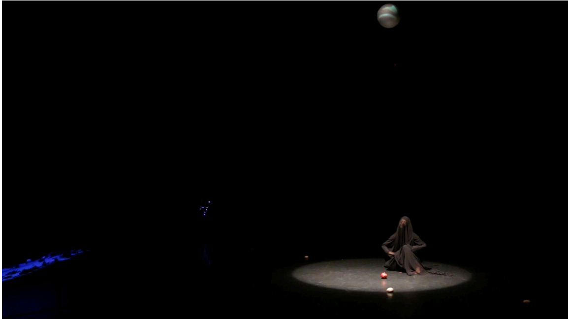
Radio Set (2025) - With Agnes Cameron